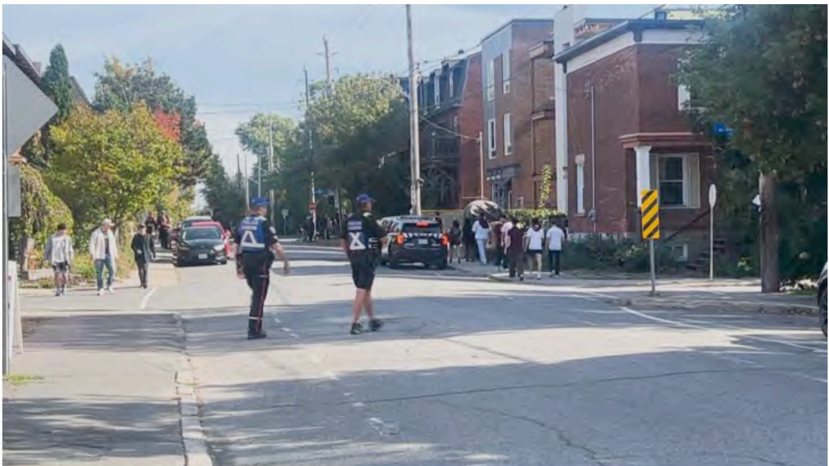
Ottawa police officers in Sandy Hill during Panda Game weekend.

"Can't wait to take back the trophy again in 2025."